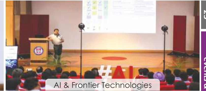
AI & Frontier Technologies