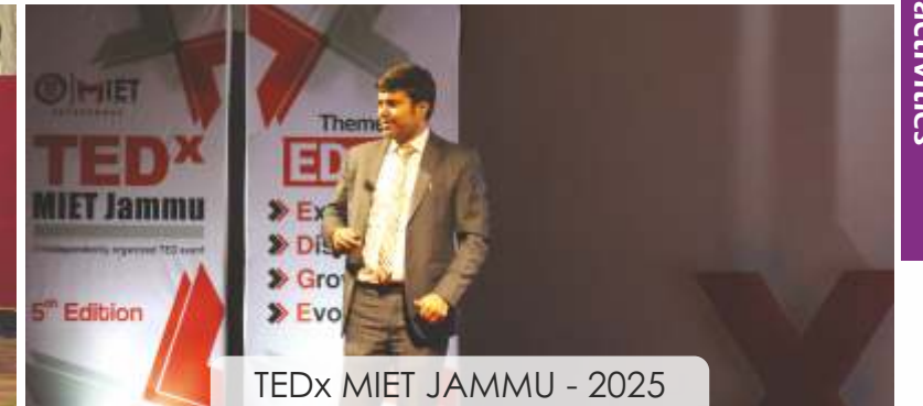
TEDx MIET JAMMU - 2025