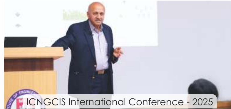
ICNGCIS International Conference - 2025