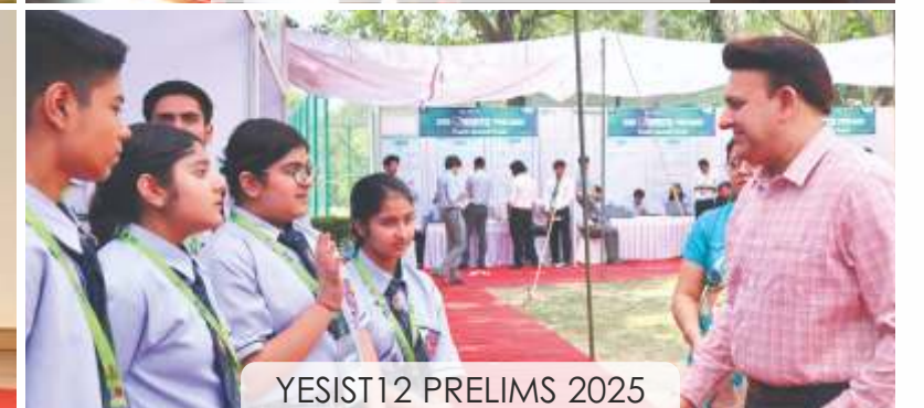
YESIST 12 PRELIMS 2025