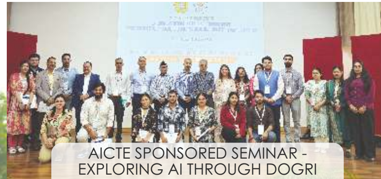
AICTE SPONSORED SEMINAR - EXPLORING AI THROUGH DOGRI