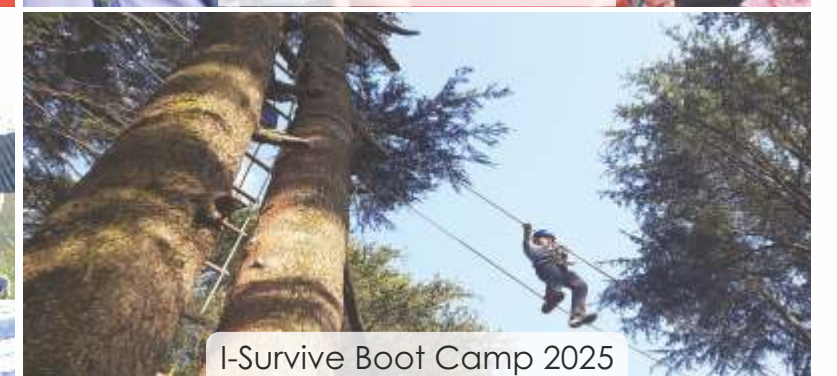
I-Survive Boot Camp 2025