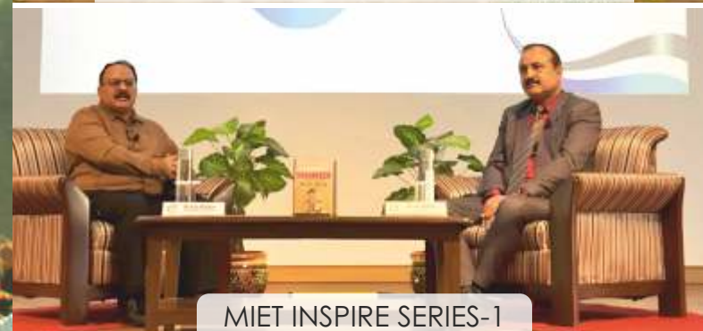
MIET INSPIRE SERIES-1